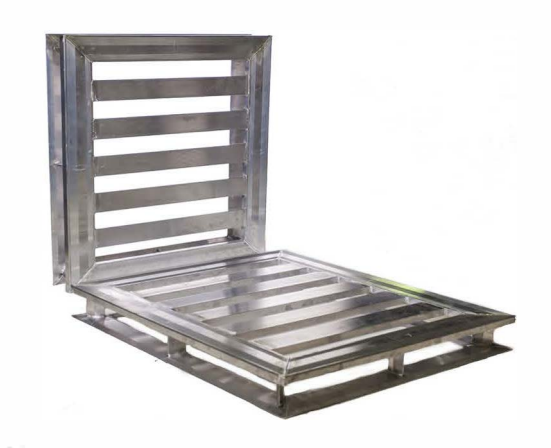
40 x 48 4way Pallet