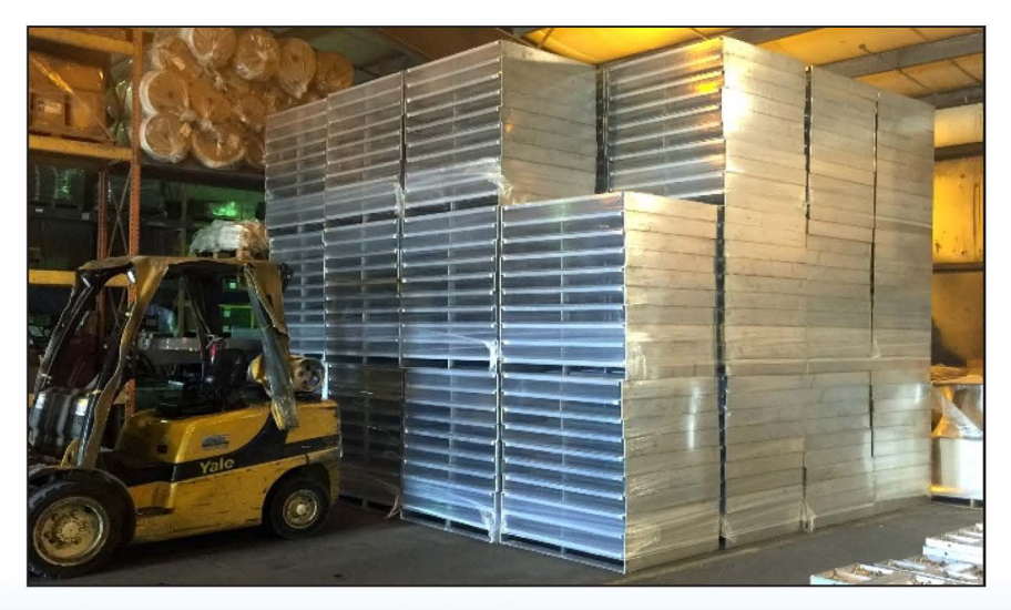
Pallets staged for shipment to a food processing company

Engineering excellence, custom design, quality service, cost saving aluminum pallet products and our leading edge technology innovations all tie together to form the foundation of Aluminum Industries solid relationship with our customers that saves them money, time, and reduces waste.