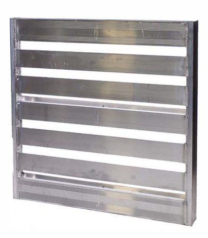
48 x 40 Push/pull Pallet